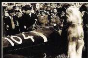
Tazio Nuvolari, the "Flying Mantuan," winner in '30 and '33.