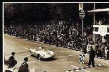
1957; chequered flag for the arrival of a Porsche 550 Spider.