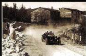
An Alfa Romeo 6C 1750 taking part in the 1929 race.