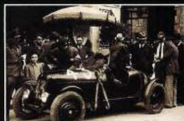
A Maserati Sport at the starting line of the 1936 "Thousand Miles."